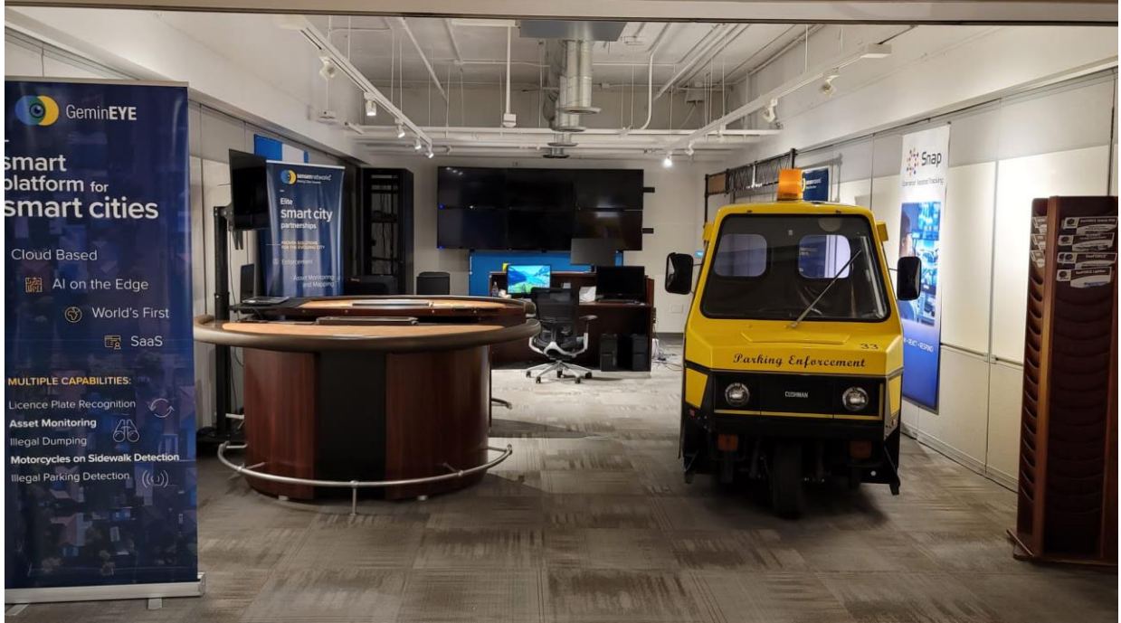
SenSen's new US HQ in the Las Vegas International Innovation Center

SenSen Networks Limited ACN 121 257 412 <u>www.sensennetworks.com</u> (+61) 3 9417 5368