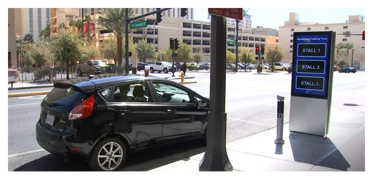
Las Vegas Curbside Corridor program

Video analytics from the devices along the curb will capture vehicle and license plate information and send utilisation data to the kiosks to kick off a countdown timer. If a vehicle remains in the loading zone after the countdown ends, the system reports the incident directly to the city, ensuring a constant flow of traffic.